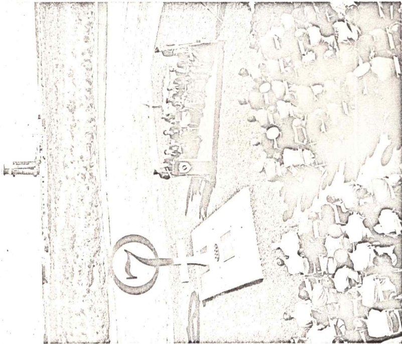
PICTURE TAKEN FROM HIGH PLATFORM